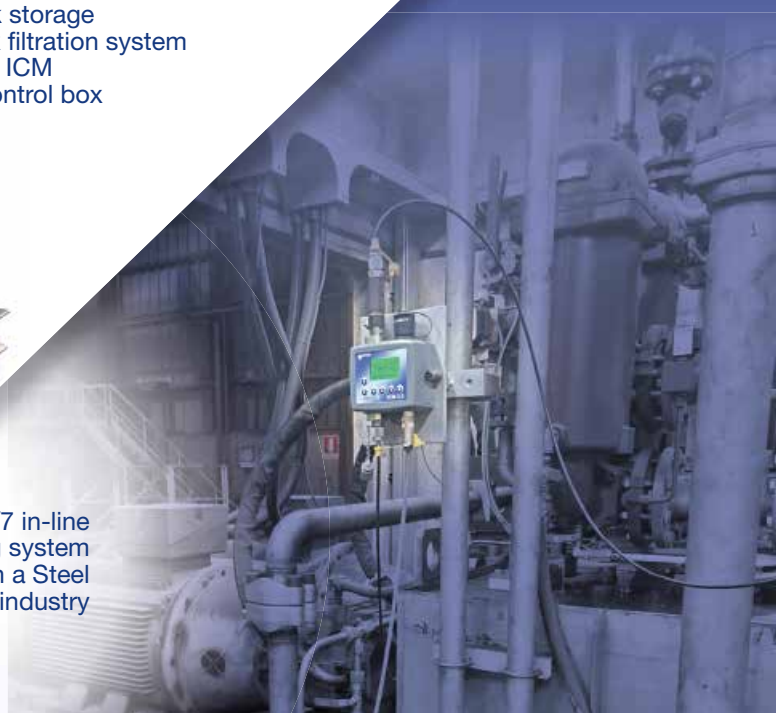
24/7 in-line monitoring system by ICM in a Steel plant industry