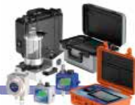
CONTAMINATION CONTROL SOLUTIONS