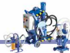
MOBILE FILTRATION UNITS